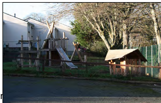
locally for all ages and abilities