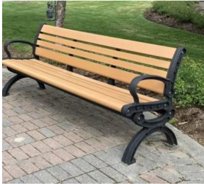
Recycled plastic and iron/aluminium arm rests/frame £600 approx