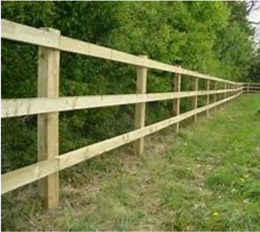
Standard post and rail