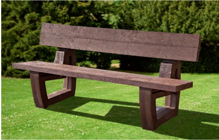
100% recycled British plastic £250-£500 (Scottish agricultural plastic)