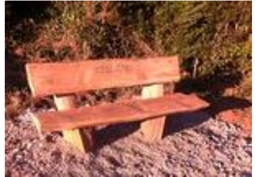
Chestnut timber rustic £500 (approx.)